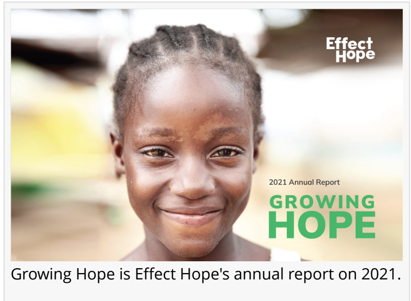
Growing Hope is Effect Hope's annual report on 2021.

MARKHAM, ONTARIO, CANADA, April 25, 2022 /EINPresswire.com/ -- After a second year of the COVID-19 pandemic, Canadian Christian global health organization Effect Hope is looking back on 2021 with the release of their annual report, " Growing Hope ." Growing Hope is the story of how the generosity of Canadians sparked transformational change for families, individuals, and communities affected by neglected tropical diseases like leprosy. People affected by these 20 diseases continue to face extreme challenges due to the pandemic.