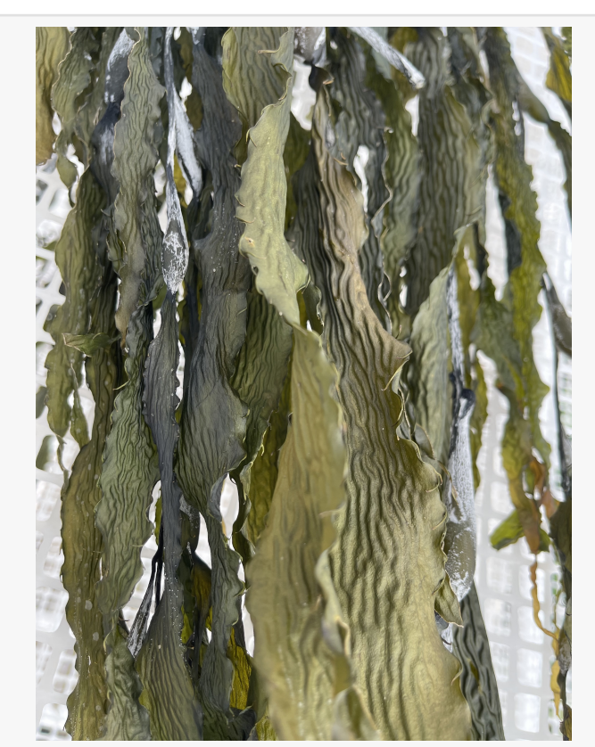
Sustainable Seaweed Harvested by Kelpful for Life Elements Collab