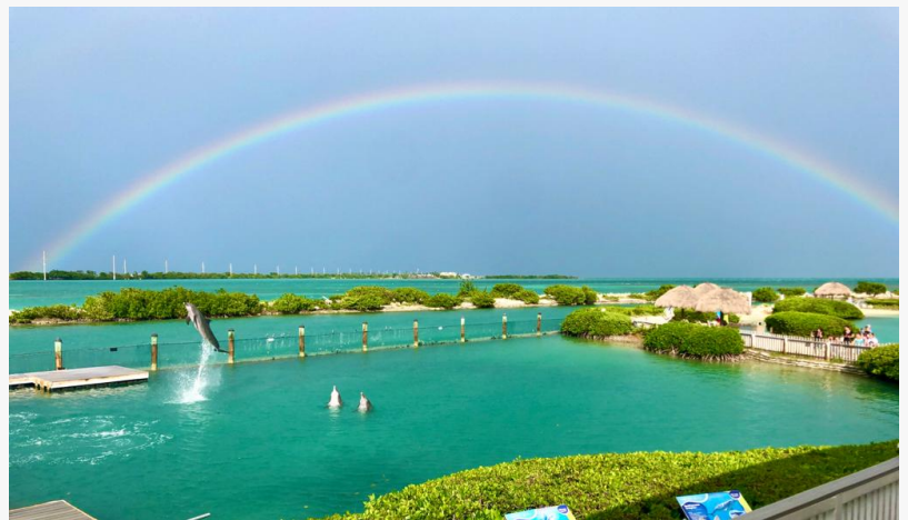
Dolphin Connection Location Afternoon