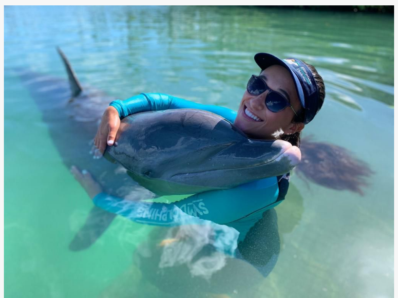
Dolphin Connection Specialist

Dolphin Connection, owned by The Dolphin Company, provides an opportunity for guests to