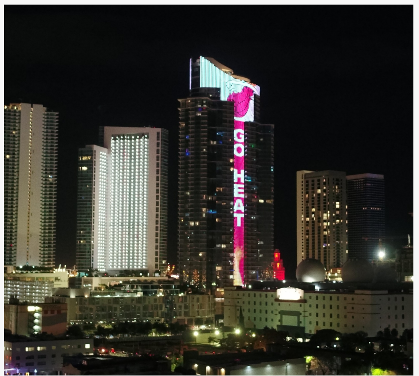
NBA Playoffs: 700-Foot-Tall Paramount Miami Worldcenter Lights-Up Largest Miami Heat Logo

The futuristic Paramount Tower rises from the heart of the $4-billion, 27-acre Miami Worldcenter.