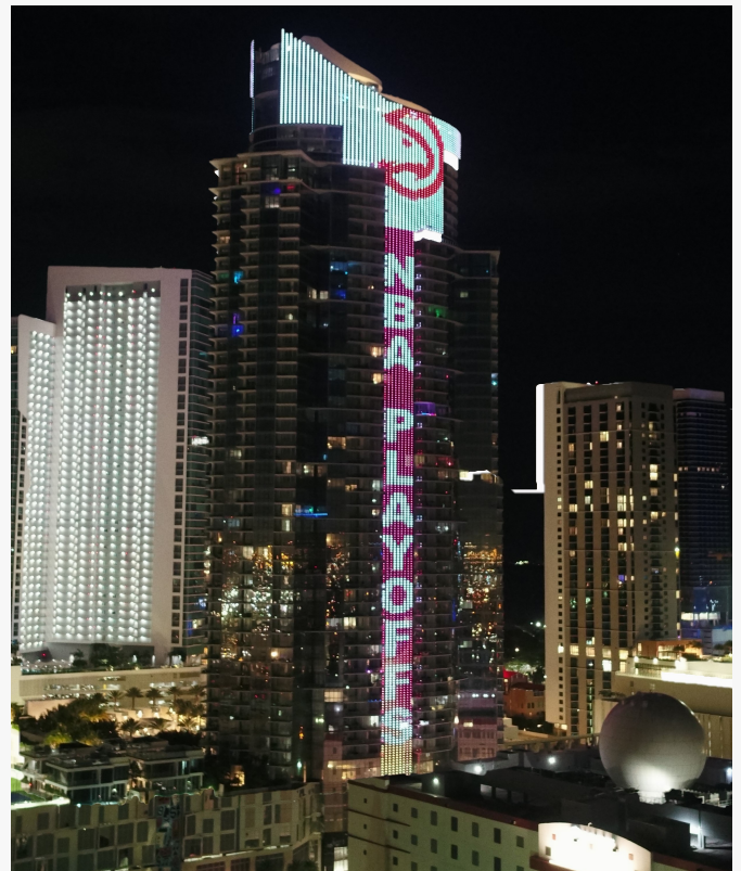
NBA Playoffs: 700-Foot-Tall Paramount Miami Worldcenter Lights-Up Largest Atlanta Hawks Logo

Paramount Miami Worldcenter's Skydeck Crown is lighting-up with a 100-yard-wide by 100-foot-