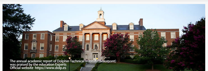
The annual academic report of Dolphin Technical Institute(Beaumont)

into a quicker path to degrees; Career-focused education linking coursework to the type of skills employers seek, based upon Bureau of Labor Statistics data; Professional development courses that are skills-focused, self-paced, and designed to provide learners the career-ready skills that employers are seeking; Senior managers and business owners learn independently to