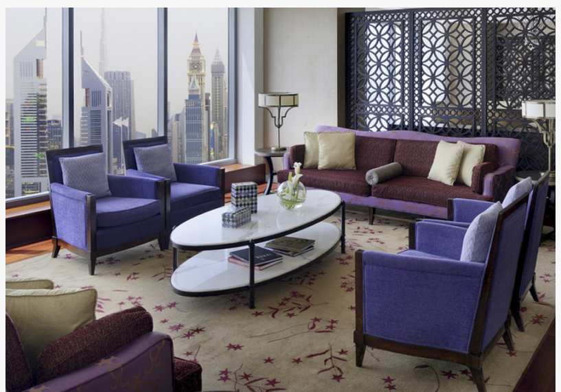
Presidential Suite H Hotel Dubai

Whatever day of the week it is, the drinks deals at H Barkeep are on coming, thanks to a fantastic