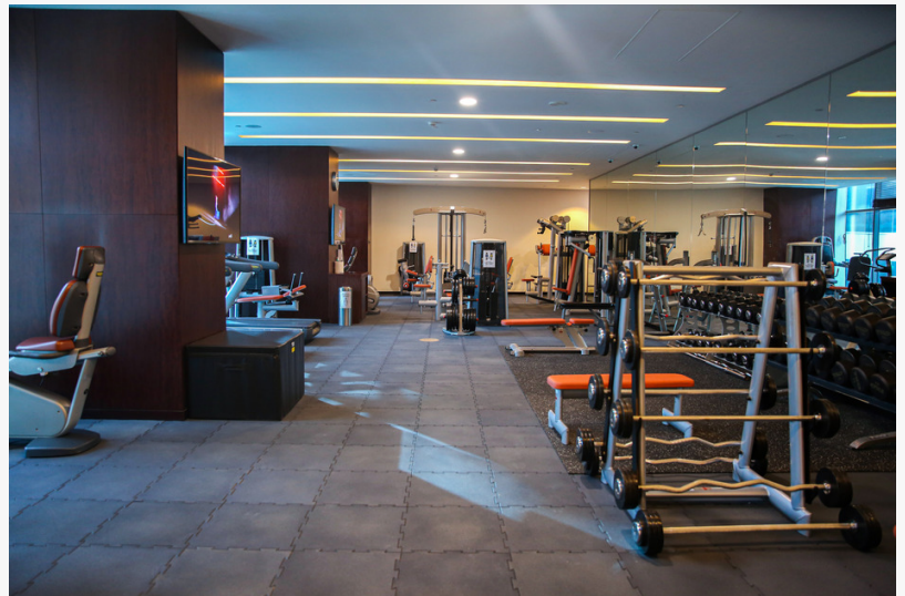
Quantum Gym H Hotel Dubai