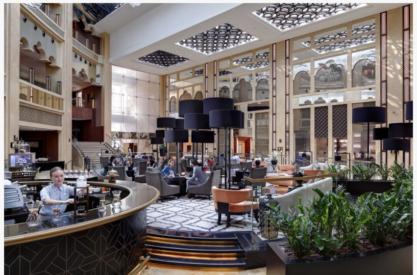
The H Dubai BAR