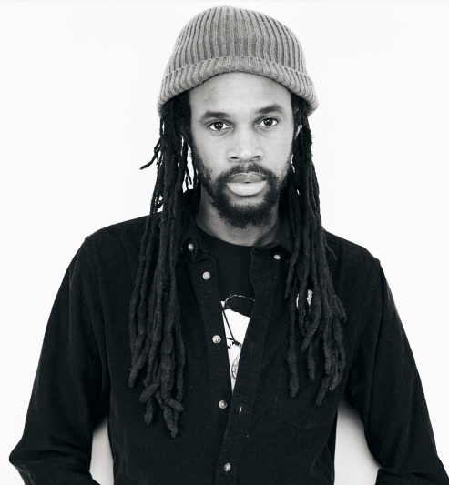
Autarchii - "2000 Years" features on the Generation Gap Riddim