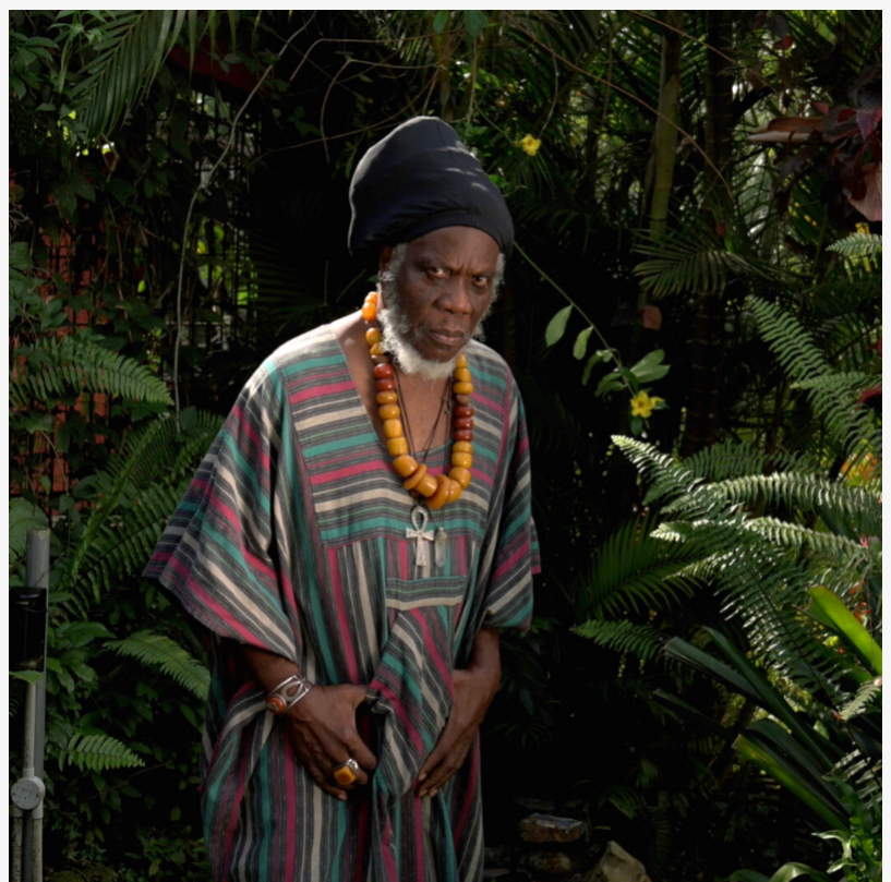
Mutabaruka - "I Am" features on the Generation Gap Riddim