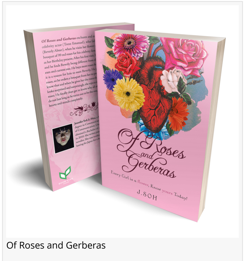
Of Roses and Gerberas