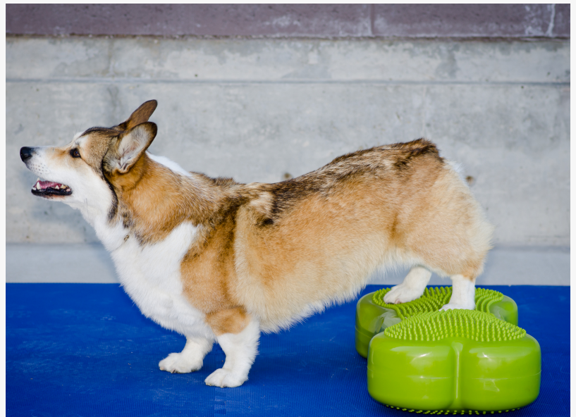
Muscle Strengthening Exercises on the K9-FitBones