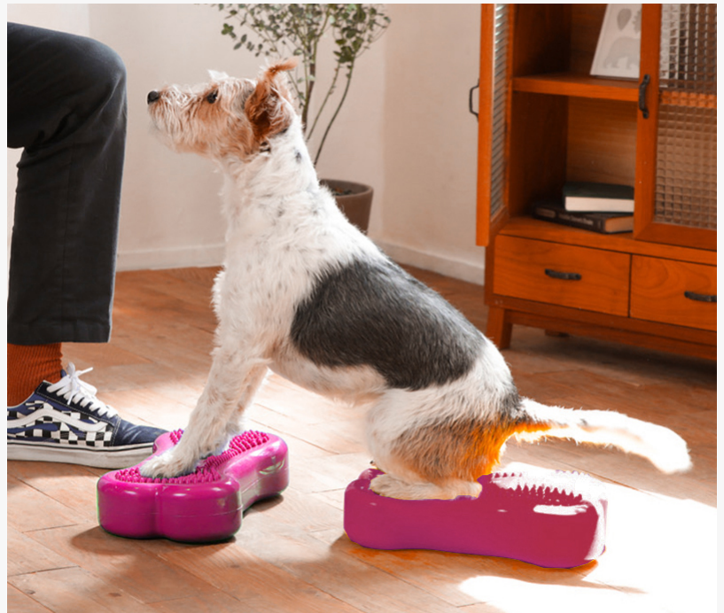
Dog Sitting on the Mini K9FITbone

ARDEN HILLS, MN, USA, April 25, 2022 /EINPresswire.com/ -- Animal Ortho Care (AOC) has announced it will offer FitPAWS, a member of the Paw Prosper family of brands focused on providing high quality canine rehab and conditioning equipment. AOC will now be carrying FitPAWS directly on their site, making it available to pet owners looking to rehab their pets at home. This new announcement comes on the heels of AOC launching an adjustable pet wheelchair .