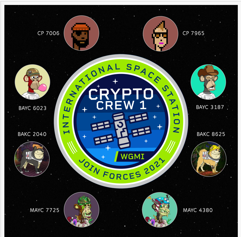
Crypto Crew 1 NFT Collection - Dec 1, 2021