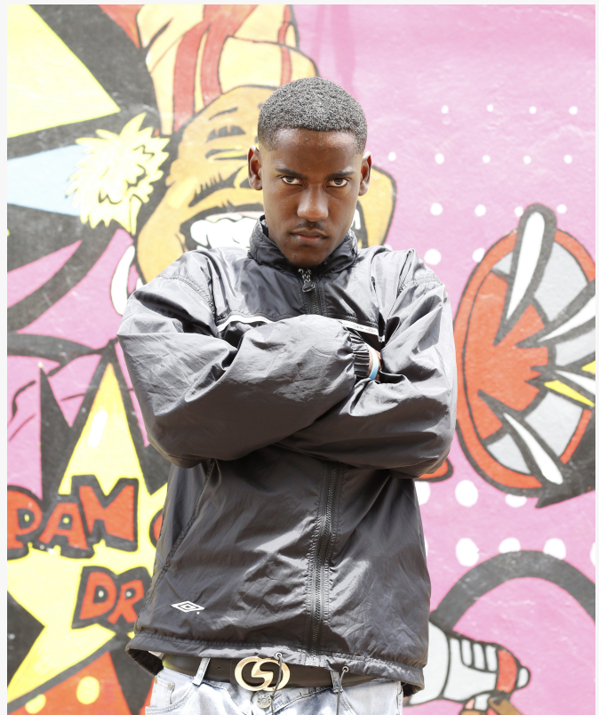
MVB Records Young Dubai Photo Shoot