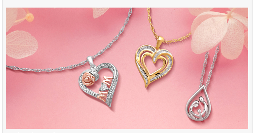
Gift Ideas for MOM