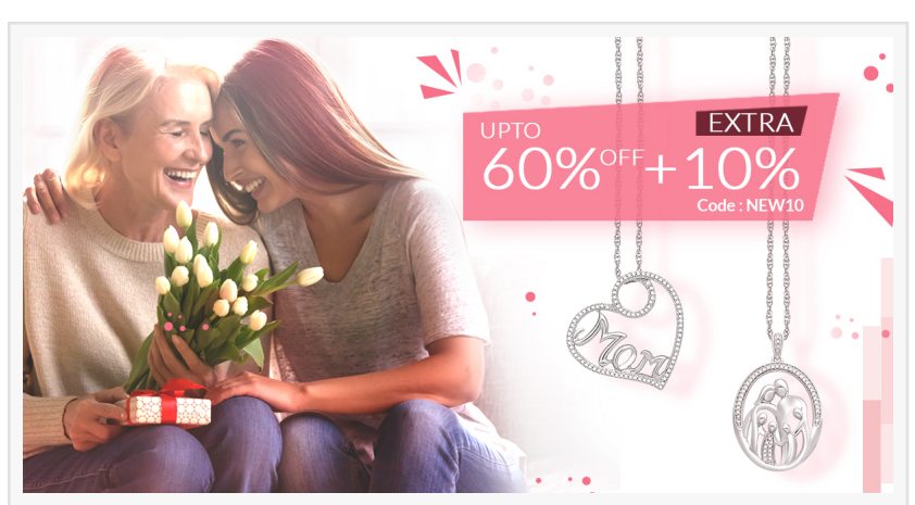
Mother's Day 2022 Jewelry Gifts