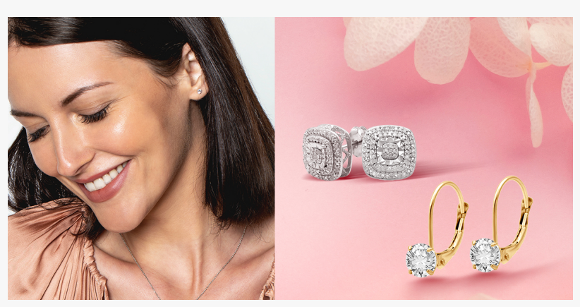
Mothers Day Gift Ideas