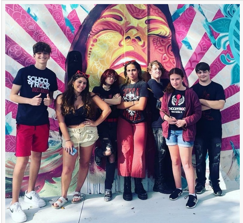
School of Rock Boca Raton students will perform in Mid-Season Showcase as part of the free and open-to-the-public live community music fest at BRiC on Saturday, May 21.