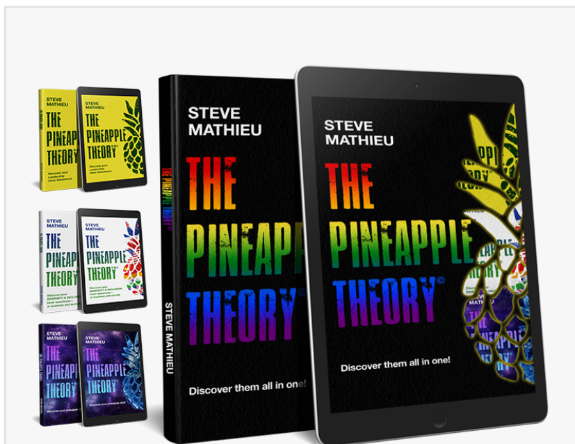
The original 3 - Assemble!