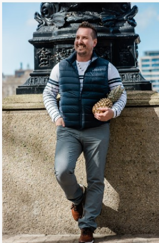
Mr. Pineapple in London