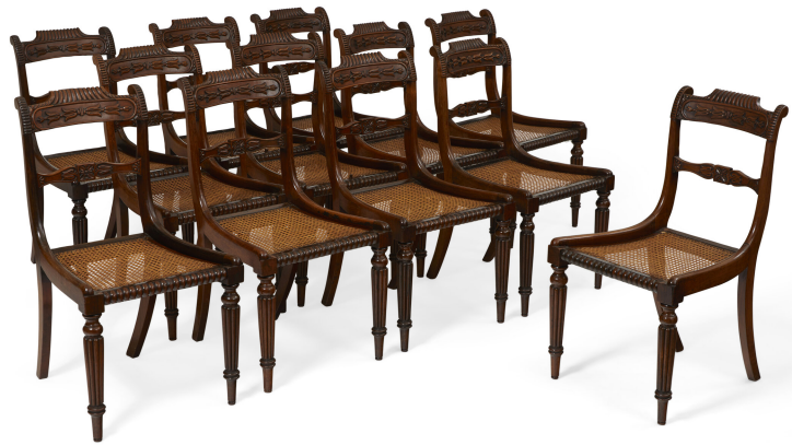
Set of twelve William IV mahogany dining chairs, second quarter 19th century (est. $4,000-$6,000).