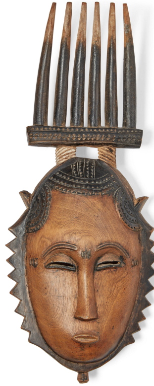
Yaure wood mask (est. $800-$1,200).

Plans may change in accordance with Los Angeles County Department of health Covid-19 restrictions. Contact the gallery for details. The gallery is located at 2221 South Main Street in downtown Los Angeles. Absentee bids will also be accepted. To schedule a preview appointment, call (213) 748-8008; or, you can email them at info@andrewjonesauctions.com .