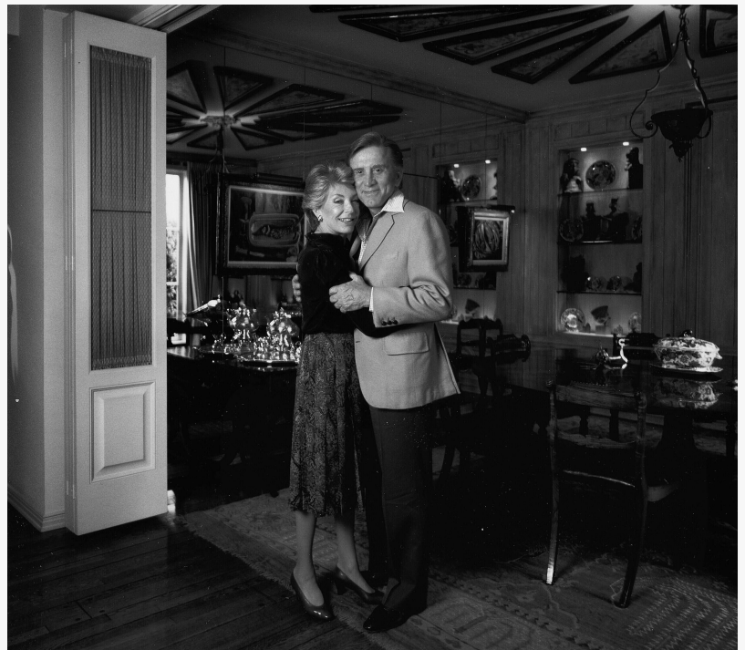
The sale of property from the collection of Kirk and Anne Douglas, gathered over six decades, will go to benefit The Douglas Foundation.

Kirk met Anne Buydens, a film publicist, on the set of Act of Love in 1953 and they married a year later. Before joining the film industry, Anne worked in a Paris gallery where she developed a keen eye for modern art. Kirk and Anne Douglas spent six decades building a collection of fine