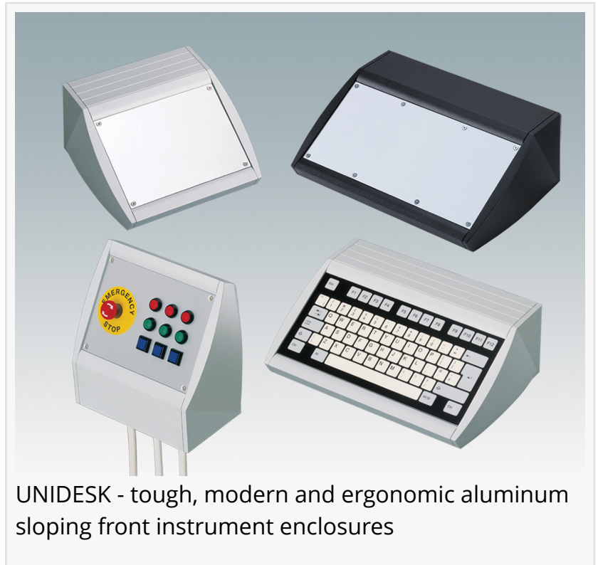
UNIDESK - tough, modern and ergonomic aluminum sloping front instrument enclosures

The flat rear panel can be machined to create apertures for connectors, switches and power inlets. The base has pre-punched PCB fixing points.