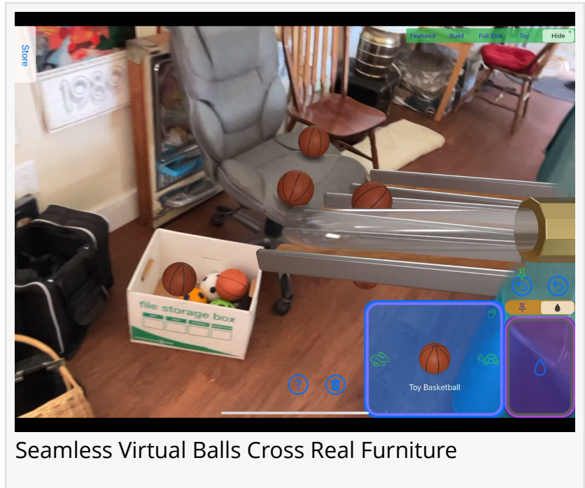
Seamless Virtual Balls Cross Real Furniture

The app lets users build physically realistic 3D scenes into their space with tacks, planks and other virtual objects. The LiDAR 3D depth sensors in iPhone and iPad Pros see the shape of the user's space, so virtual objects seamlessly collide, slide, bounce, roll across surfaces, and disappear behind real ones.