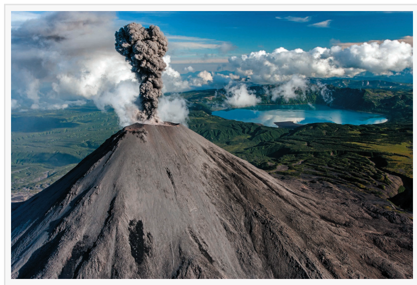
Scene from Russia From Above

"Russia From Above" is a two hour long documentary on the various rich landscapes of Russia, filmed in 4K by drones. The film is narrated by Emmy Award winning and Academy Award nominated actor John Malkovich. Long before, of course, the country became synonymous with the world's nemesis when it attacked neighboring Ukraine with its military forces in February. The film does not refer to that in a single word and truely so, as it pays tribute to the beautiful differentiated landscape of Russia with its rich nature, beautiful architecture and colorful people. The film actually only makes you regret the war that is raging at the moment even