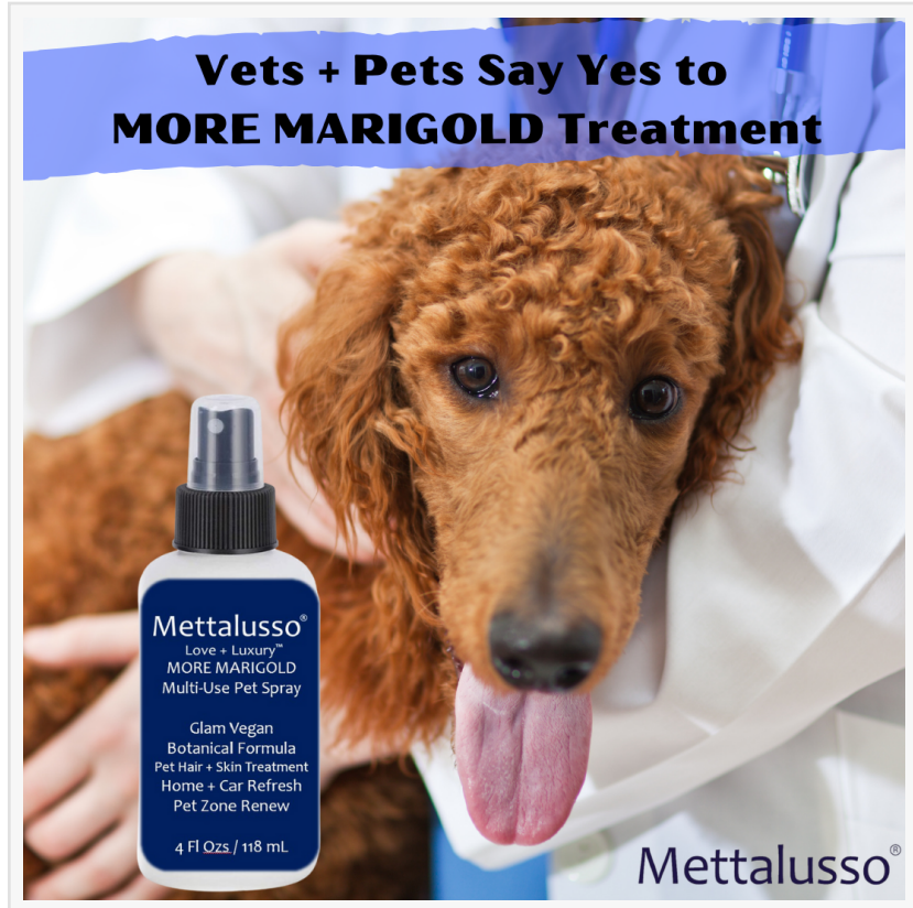
MORE Marigold Vegan Spray Conditioner For Pets and Home by Mettalusso

This press release can be viewed online at: https://www.einpresswire.com/article/570368559