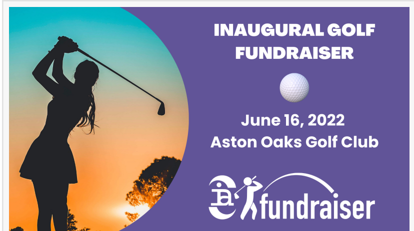
INTERalliance Golf Fundraiser

Cincinnati. Member companies of the INTERalliance include Procter & Gamble, Great American Insurance, FIS, GE, Vora Ventures, Fifth Third Bank, and Western & Southern Financial Group, among many others. For more information about INTERalliance School Chapters or to learn how