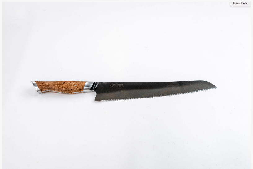
The STEELPORT Bread Knife is a high performance bread knife with custom wavy serration for more than just bread. N