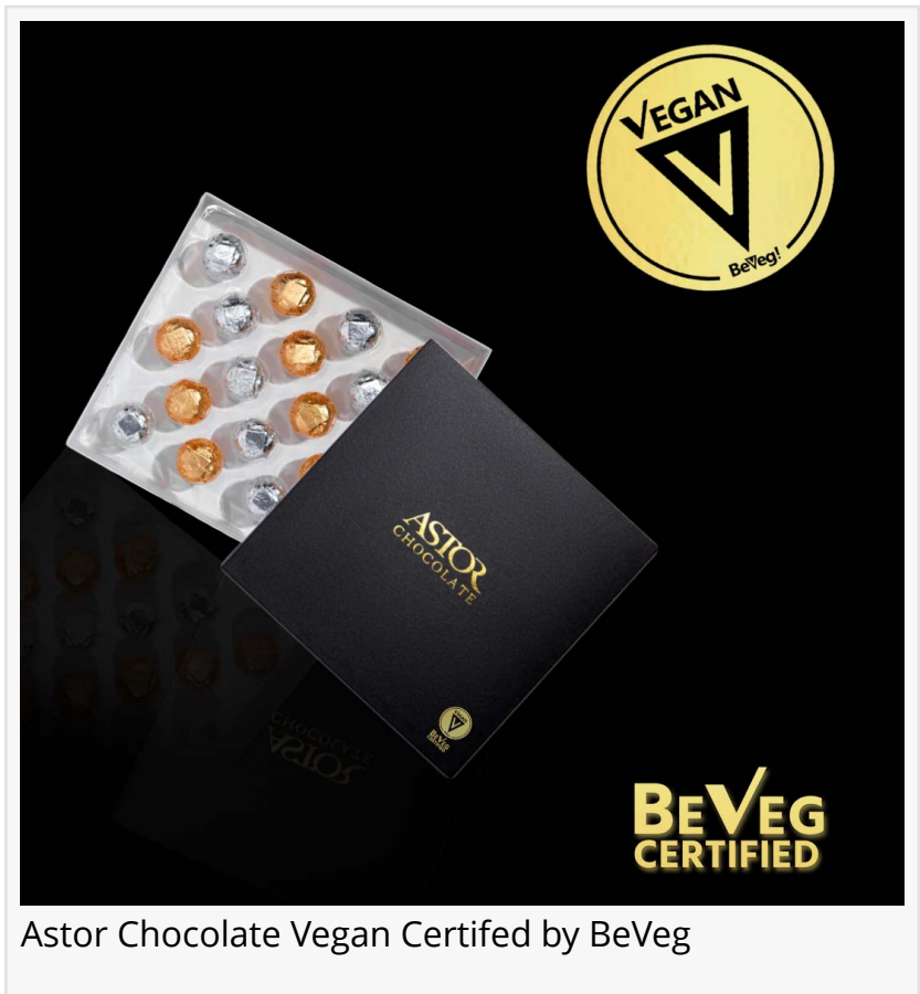
Astor Chocolate Vegan Certified by BeVeg

BeVeg International BeVeg Int'l Vegan Cert +1 866-529-1114 email us here