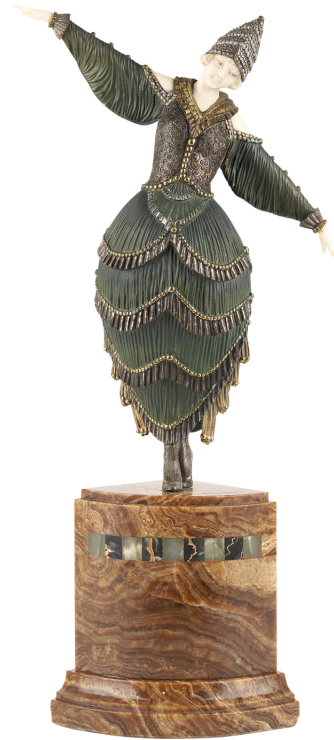
Art Deco bronze sculpture by Romanian artist Demetre Chiparus (1886-1947), depicting a female dancer with arms outstretched. 17 ¼ inches tall (est. CA$15,000-$20,000).

There are two Art Deco sculptures by Demetre Chiparus, both of them chryselephantine bronzes depicting female dancers with arms outstretched. One is a rare, early 20th century cold painted and bone mounted (chryselephantine) figural bronze, 17 ¼ inches tall (est. $15,000-$20,000). The other is a gilt bronze, bone mounted figure, 23 ¾ inches tall (est. $10,000-$12,000). Both are signed “D.H.