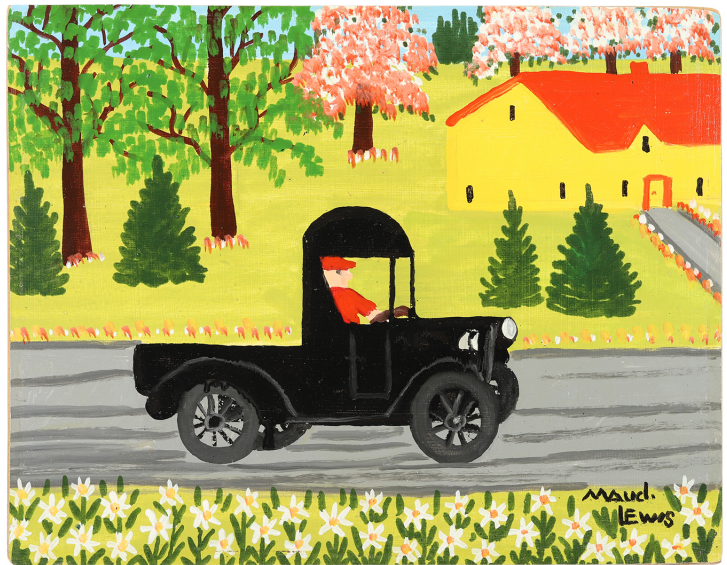
Oil on Masonite board painting by the renowned Canadian artist Maud Lewis (1901-1970), titled Black Truck (1967), measuring 11 inches by 14 inches (est. CA$30,000-$35,000).