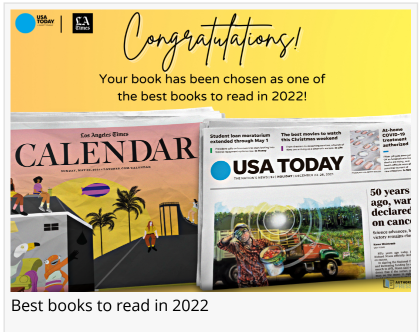
Best books to read in 2022

in his monumental earlier books. It's easy to be pessimistic about inequality. We know it has increased dramatically in many parts of the world over the past two generations. No one has done more to reveal the problem than Thomas Piketty. Now, in this surprising and powerful new work, Piketty reminds us that the grand sweep of history gives us reasons to be optimistic. Over the centuries, he shows, we have been moving toward greater equality.