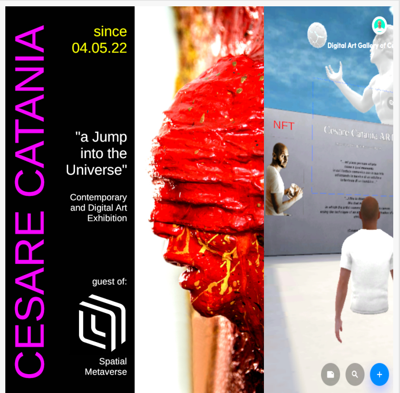
Poster of Cesare Catania's art exhibition in the Spatial Metaverse