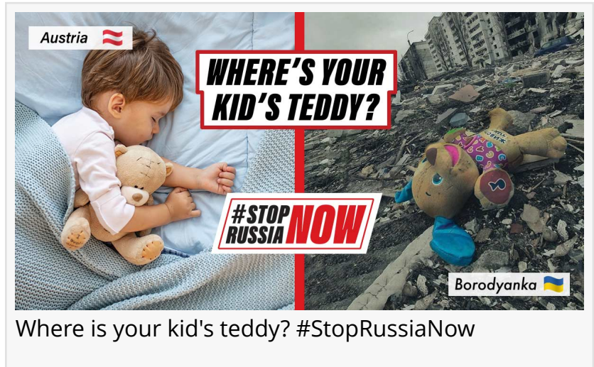
Where is your kid's teddy? #StopRussiaNow

WROCLAW, LOWER SILESIA, POLSKA, May 1, 2022 /EINPresswire.com/ -- The stories of successful Ukrainian women who loved to do their job, succeeded in it and had great prospects are abruptly interrupted by the wail of an air-raid siren. The shrill sound penetrates the depths of the soul and makes you shudder. Millions of Ukrainians hear it in real life. Several times per day. Not from the laptop screen.