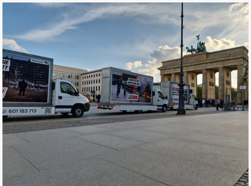
#StopRussiaNOW billboard cruising around Europe

This press release can be viewed online at: https://www.einpresswire.com/article/570569507