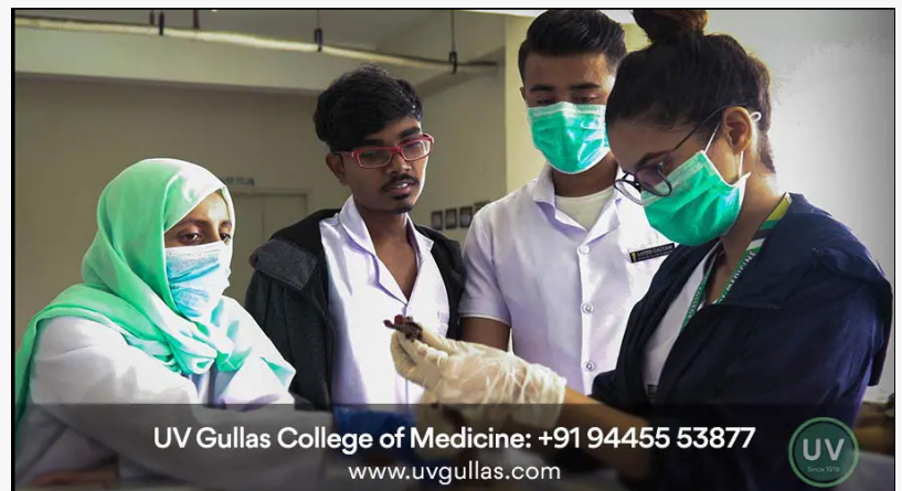
UV Gullas Students Interact with Teacher