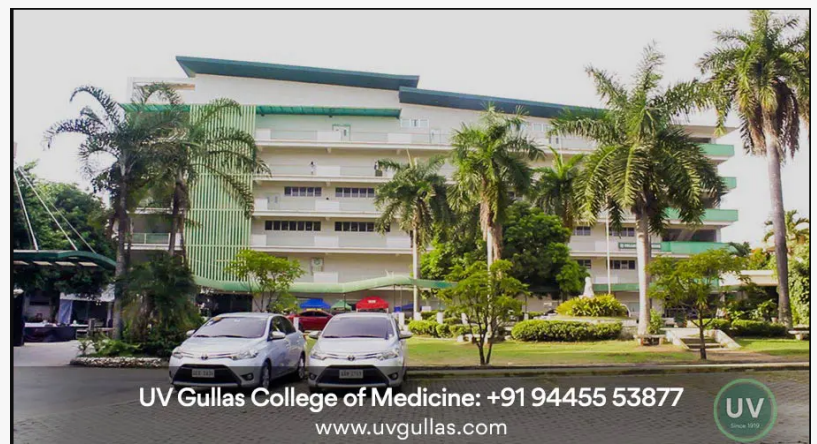
UV Gullas Renovated Campus