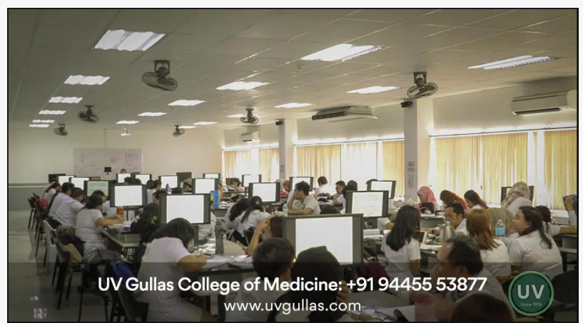
UV Gullas Smart Facility class room

You should also be aware that in Philippines, the MBBS programme is referred recognized as the MD programme (Doctor of Medicine). It is the Indian counterpart of the MBBS (Bachelor of Medicine and Surgery).