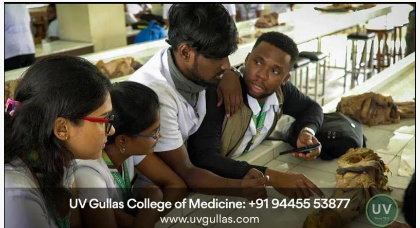
UV Gullas Students Practice with Cadaver