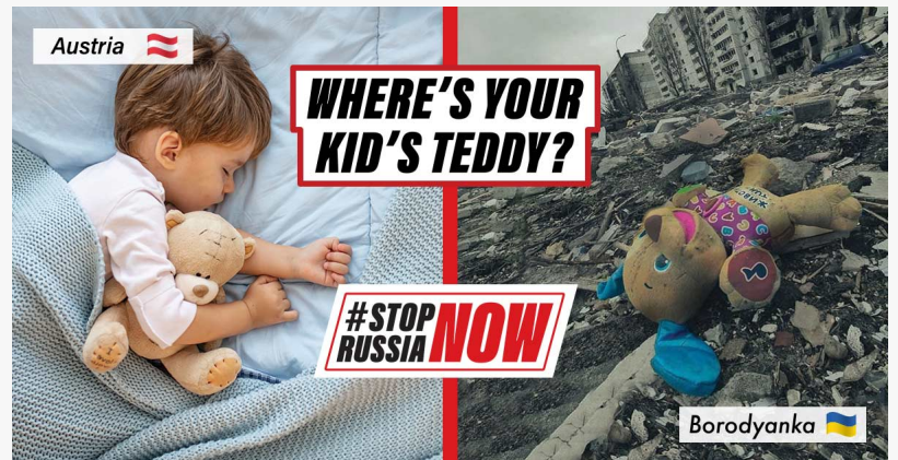
Where is your kid's teddy? #StopRussiaNow