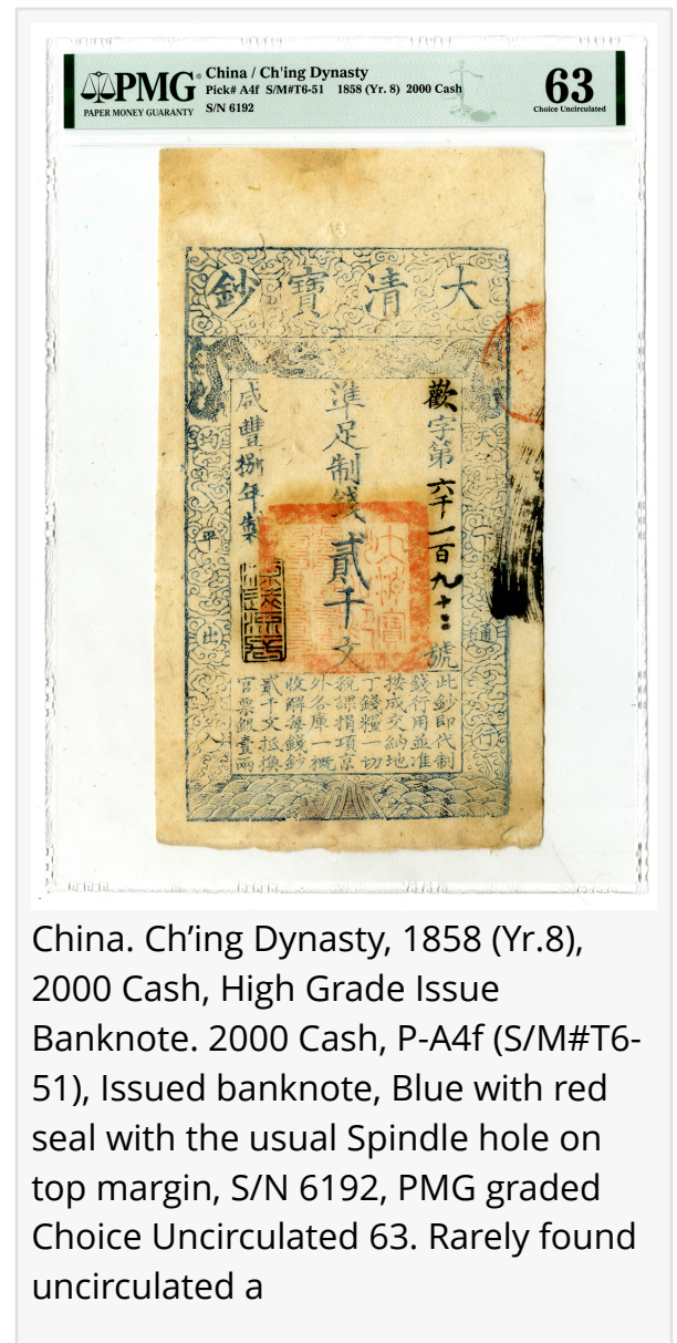
China. Ch'ing Dynasty, 1858 (Yr.8), 2000 Cash, High Grade Issue Banknote. 2000 Cash, P-A4f (S/M#T6-51), Issued banknote, Blue with red seal with the usual Spindle hole on top margin, S/N 6192, PMG graded Choice Uncirculated 63. Rarely found uncirculated a

Robert I Schwartz Archives International Auctions, LLC +1 201-944-4800 email us here