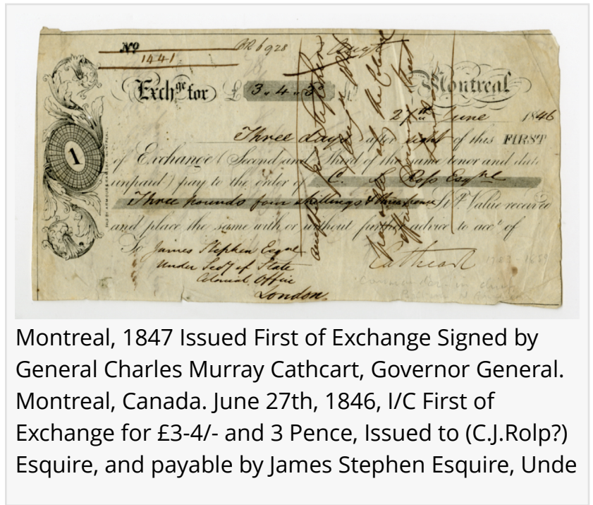
Montreal, 1847 Issued First of Exchange Signed by General Charles Murray Cathcart, Governor General. Montreal, Canada. June 27th, 1846, I/C First of Exchange for £3-4/- and 3 Pence, Issued to (C.J.Rolp?) Esquire, and payable by James Stephen Esquire, Unde

Uncirculated 64 EPQ; and dozens of other Chinese banknote rarities. Additional world banknote highlights include an 1847, Montreal, First of Exchange signed by General C.M. Cathcart , Governor-General of the Province of Canada; a Democratic Republic of the Congo, 1963, 5000 Francs Specimen; Greece is highlighted by 12 exciting and desirable lots including 7 rare Bank of Greece notes including the highest graded Bank of Greece, 1941, 50 Drachmai, P-168, Graded superb Gem Unc. 67 EPQ; the highest graded New Caledonia, Banque de L'Indochine, 1963, 1000 Francs example graded Choice Uncirculated 64 is offered; and numerous rare and desirable banknotes throughout that are too numerous to mention.