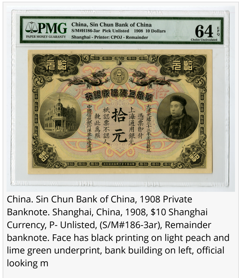
China. Sin Chun Bank of China, 1908 Private Banknote. Shanghai, China, 1908, $10 Shanghai Currency, P- Unlisted, (S/M#186-3ar), Remainder banknote. Face has black printing on light peach and lime green underprint, bank building on left, official looking m

The auction begins with 460 lots of world highlighted by 2 sequential high-grade examples of Ch'ing Dynasty, 1858, 2000 Cash notes that are both graded Choice Uncirculated 63; a 1949 Peoples Republic of China, 100 Yuan, P-832b rare variety; the Bank of Taiwan, 1946, 100 Yuan, P-1940 graded Superb Gem Uncirculated 67 EPQ and the highest grade for this note; 3 different specimen and proof, International Banking Corporation rarities dating from 1905 to 1918; an outstanding 1908 Sin Chun Bank of China, Private Banknote rarity graded PMG Choice