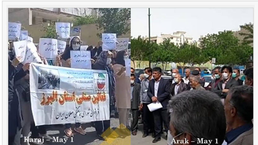
On Sunday, May 1st, 2022, workers and teachers despite massive security measures, and the arrest of a number of them from previous days, teachers and workers held protest rallies in many cities across Iran they demanded their rights.

Teachers protested in front of education departments in other cities including Arak, Kermanshah, Qazvin, Shiraz, Ahvaz, Bushehr, Saez, Nourabad Fars, Homayoun Shahr, Tabriz, Karaj, Aligudarz, Yazd, Isfahan, Harsin, Khorramabad, Yasuj, Langarud, Dehdasht, Delfan, Rasht,