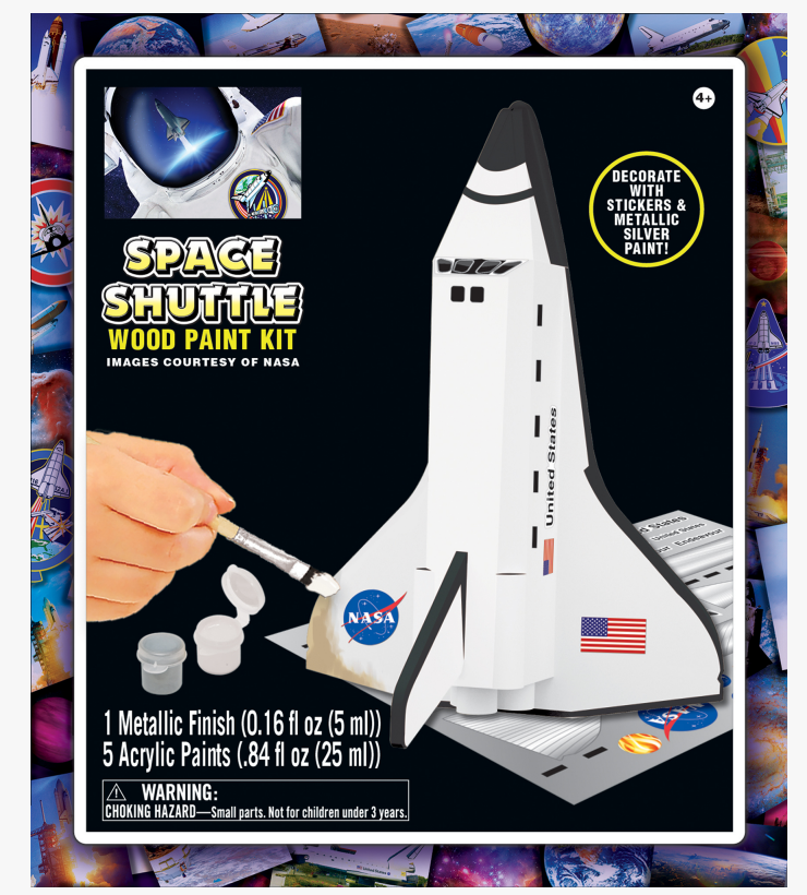
MasterPieces' NASA Discovery Space Shuttle Wood Craft and Paint Kit

games and crafts and well-known seasonal puzzles and games, to classic outdoor licensed