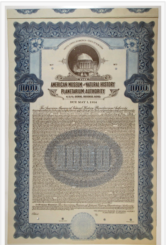
American Museum of Natural History Planetary Authority, 1934 Specimen Bond Rarity