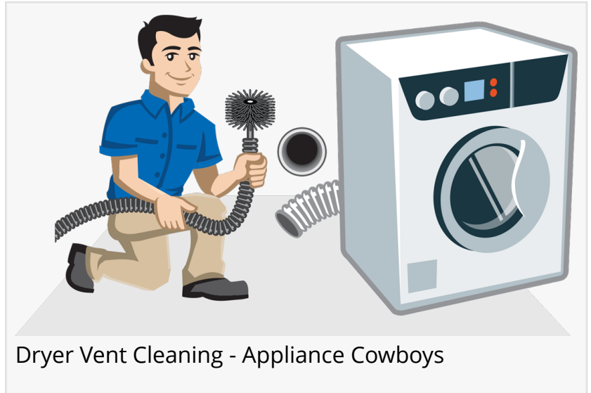
Dryer Vent Cleaning - Appliance Cowboys

What is Dryer Vent Cleaning and Why You Should Do It? Appliance Cowboys provides professional dryer vent cleaning services to ensure that your dryer is more efficient and safe. Unclogging dryer vents reduce the risk of a dryer fire, clothes dry faster, and prevent energy