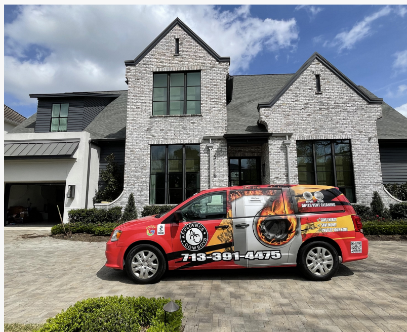
Appliance Cowboys Dryer Vent Cleaning Van

Dryer vent cleaning will help your dryer run more efficiently than a dirty dryer vent, meaning that your clothes dry faster and save you time. The dryer's life span is increased when your dryer vent is cleaned. A dirty dryer vent makes your machine work harder, meaning that your energy bill is likely to go up. A hardworking dryer can also cause it to burn out or require regular maintenance much sooner than it should. Appliance Cowboy's Cowboy's dryer vent cleaning service will help prevent fire hazards due to the clogging of the vents, reduce energy bills due to an overworking dryer, and improve your dryer's efficiency.