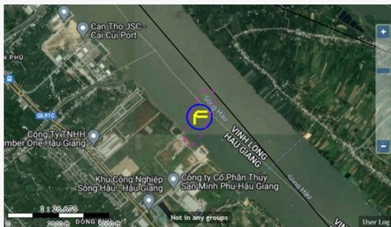
North Vietnam Correlated Emitter and Imagery Data