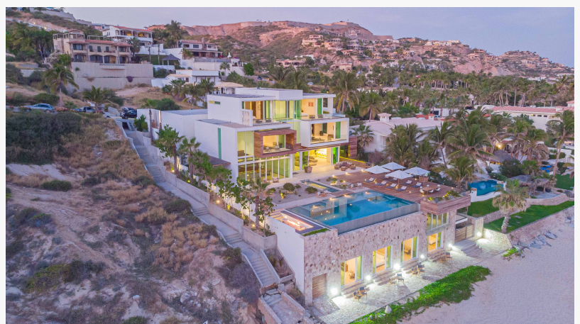
Casa Ocho in Cabo San Lucas

CABO SAN LUCAS, BCS, MEXICO, May 6, 2022 /EINPresswire.com/ -- Finding true luxury just got easier. At the tip of the baja, in Mexico's most sought-after destination, Casa Ocho is true beachfront decadence.