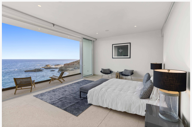
Cabo San Lucas Beachfront Bedroom