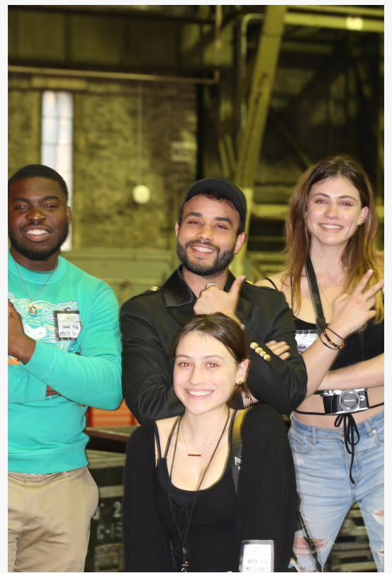
Celebrity fashion stylist Aaron Gomez wearing head to toe by The Royals

This press release can be viewed online at: https://www.einpresswire.com/article/571058500