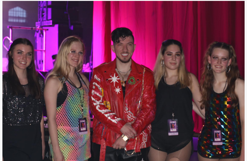
The dancers from Armstrong School of Dance