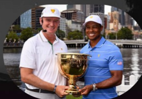
JUPW Ernie Els