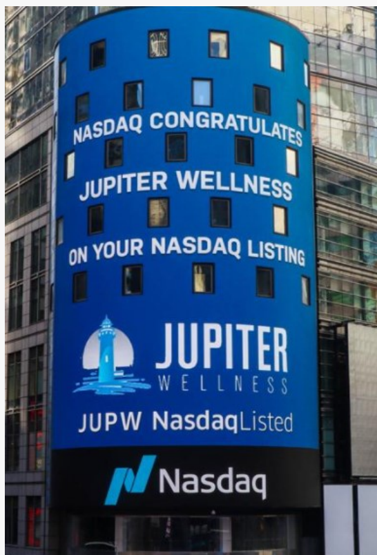
$JUPW Listed on the NASDAQ

Over the past two years, JUPW has built a portfolio of award-winning wellness brands including