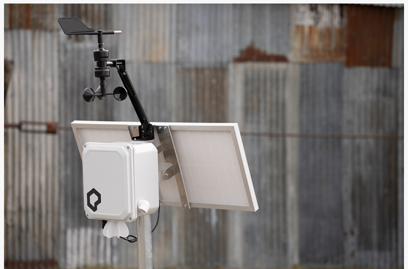
MPK Kinetic to distribute the Qube Emissions Monitoring Solution

Under the agreement, MPK will act as the exclusive provider of Qube's continuous monitoring solution in Australia and New Zealand.