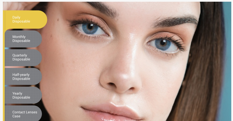
Daily disposable contact lenses

This brand of contact lenses comes in both monthly and half-year disposable options and they are all excellent prices. For example, there is Morandi monthly disposable, which will be sold for