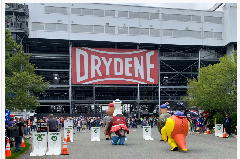
Fans and mascots alike can easily pass through the barriers.

And while there was a rain delay, moving the race completion to Monday, there was no delay in getting the Archer barriers in and out. The mobility of the barriers, despite weighing over 700 lbs. each, ensured the roadway was cleared and traffic was moving freely soon after event.