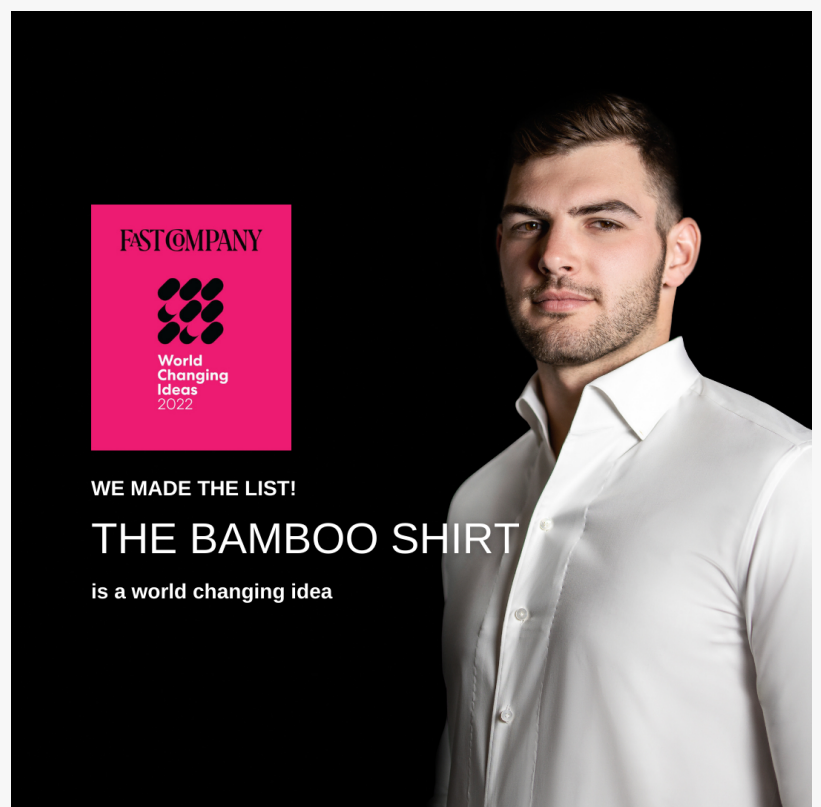
ESQ's Bamboo Shirt a Finalist for FastCompany World Changing Idea

ESQ set out to create the most comfortable and best-fitting dress shirts in a sustainable way. Mother Nature delivered with a luxuriously soft, renewable, and environmentally friendly fabric that deserves a permanent slot in your starting lineup.