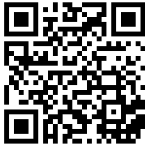
QR code for EyeLock NanoFace product