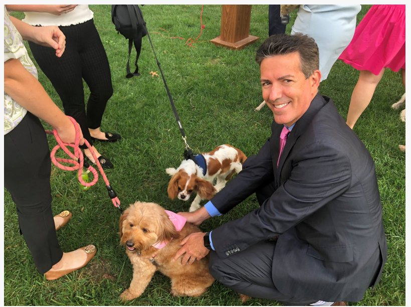
Wayne Pacelle at a U.S. Senate Press Conference on 10/7/21

“We can apply human biology-based test methods to better predict how humans will respond to