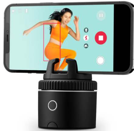
Motion Tracking AI-Technology for Content Creators

To view Pivo features enjoy this video .