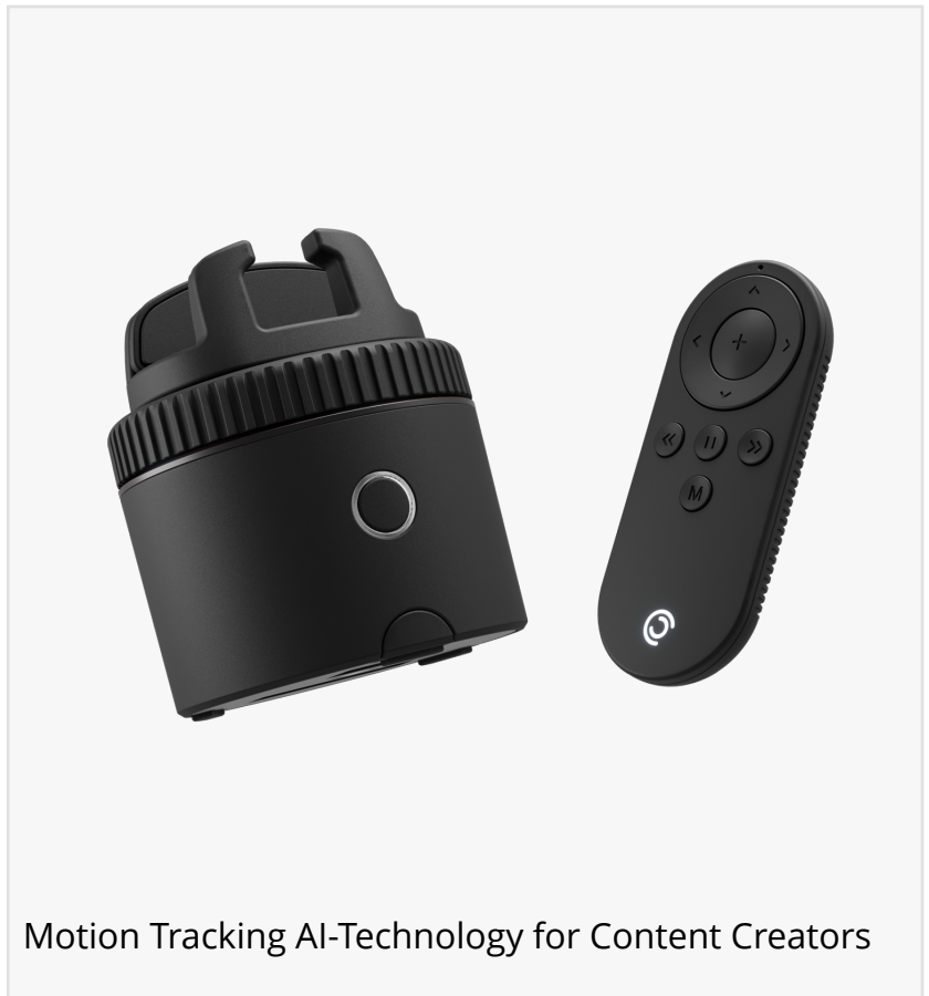
Motion Tracking AI-Technology for Content Creators

This press release can be viewed online at: https://www.einpresswire.com/article/571254256