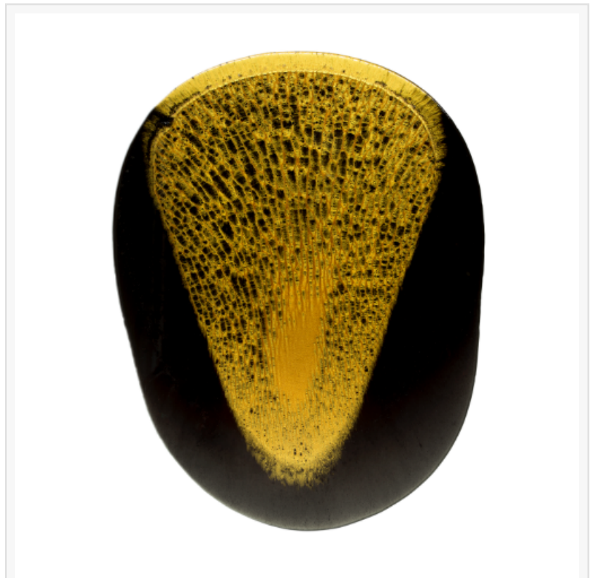
Gold Starry Dust (Artist: Carol Bruton). Part of COSMIC SERIES collection exclusively selected by uniphigood, as the inaugural Artist partnership for the ASTRA ULTRA launch on National Astronaut Day®.

This press release can be viewed online at: https://www.einpresswire.com/article/571269676