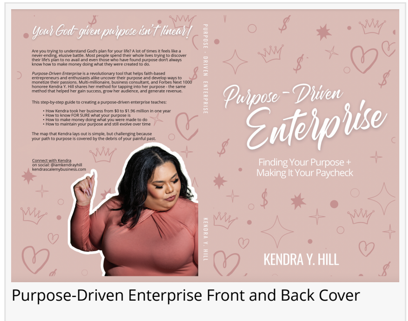
Purpose-Driven Enterprise Front and Back Cover