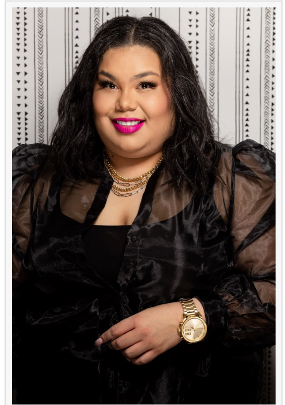
Author, Kendra Y. Hill

This press release can be viewed online at: https://www.einpresswire.com/article/571282001