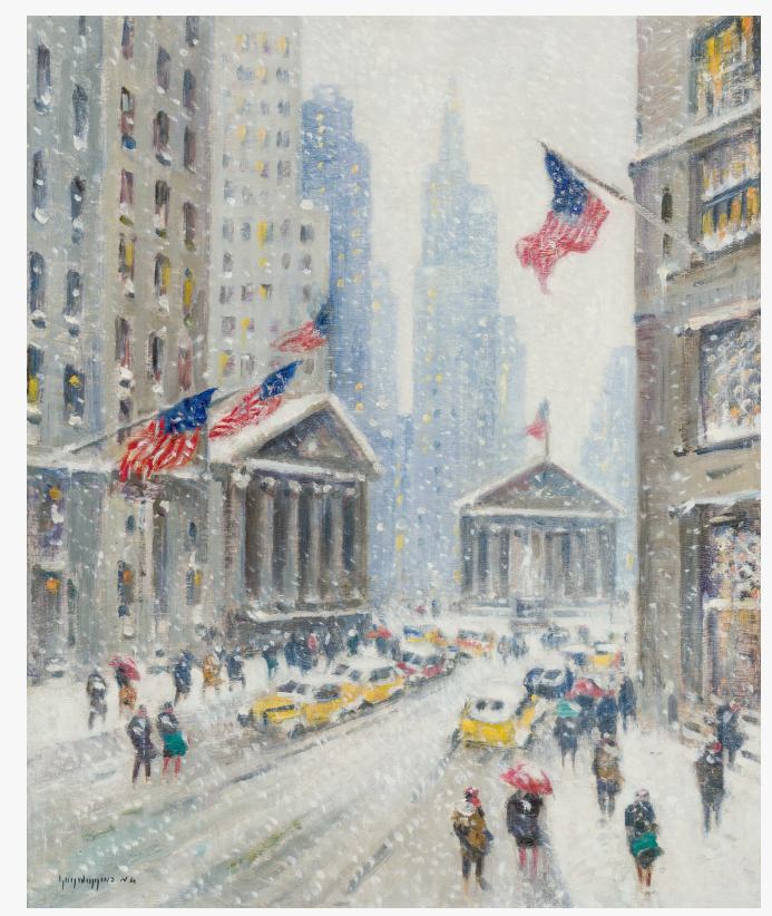
Oil on canvas by Guy Carleton Wiggins (American, 1883–1962), titled Broad St. And The Sub Treasury, signed, 30 inches by 25 inches ($112,500)