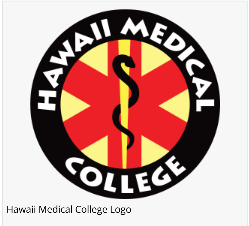
Hawaii Medical College Logo

While a number of Hawaii schools that offered similar programs have shuttered, HMC has been able to grow and thrive. The loss of vocational schools has left local medical centers, clinics, hospitals and pharmacies with fewer candidates to choose from for their many open positions. Hawaii Medical College is working to increase enrollment to help fill those needs.