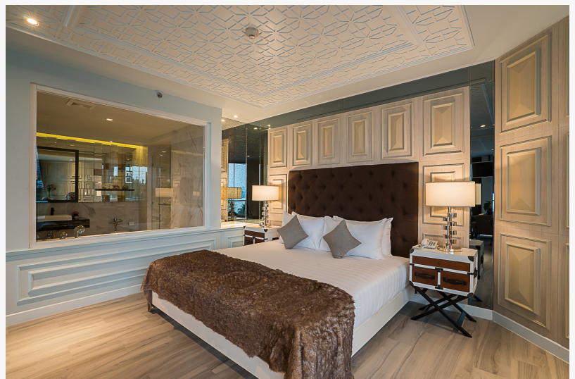
Junior Suite Room